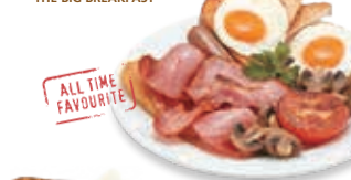
THE BIG BREAKFAST