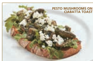
PESTO MUSHROOMS ON CIABATTA TOAST