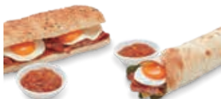
TOASTED BACON & EGG ROLL